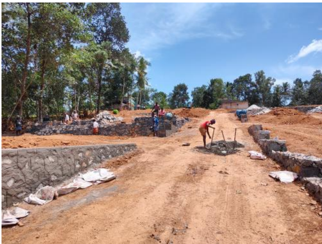
Plot development in progress at Chaikkottukonam Venkulam, Neyyatinkara Municipality.