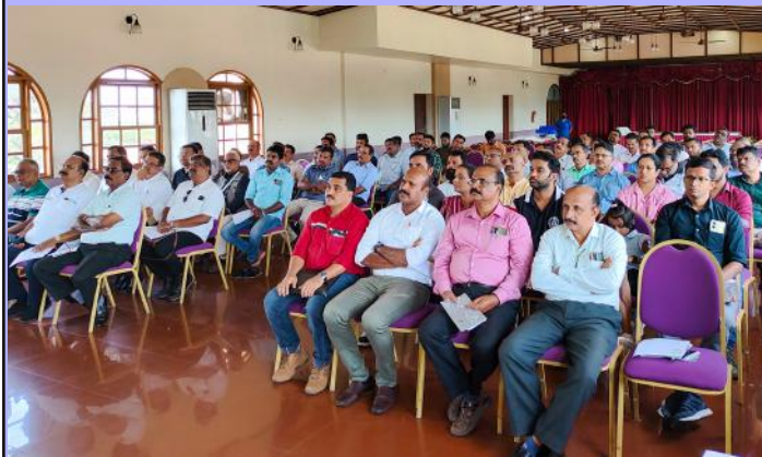
The Real Estate Agents from Kerala central zone attending the Interactive Session by K-RERA at BTH hotel, Ernakulam.