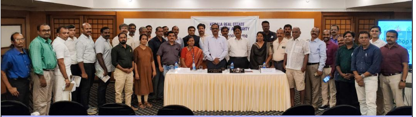
'Harmony Handshake': RERA Registered Agents from Thiruvananthapuram, Kollam and Pathanamthitta Districts with the K-RERA team at Mascot Hotel Thiruvananthapuram.